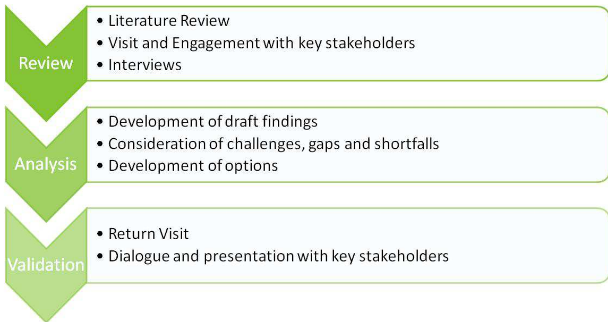
Figure 1-1: The three stages of the Copiapó River Basin water rights scoping study

The present report provides the conclusions from this work.